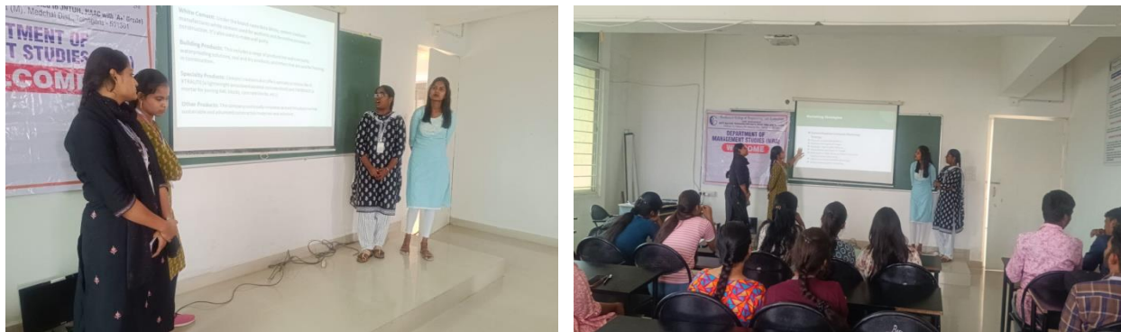
Topic: Cement Creation