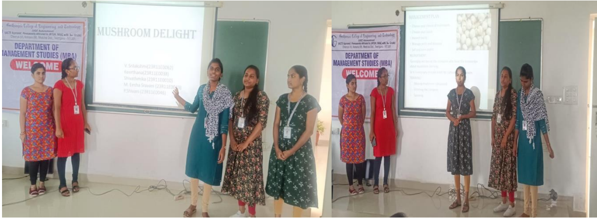
Topic: Mushroom Delight