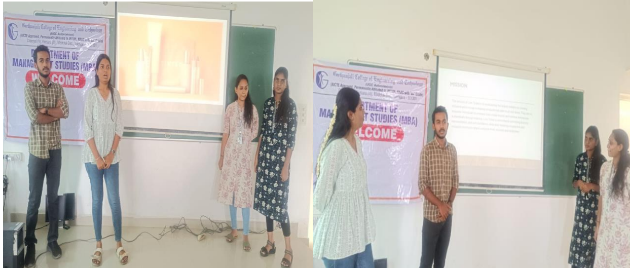
Topic : Live Trend